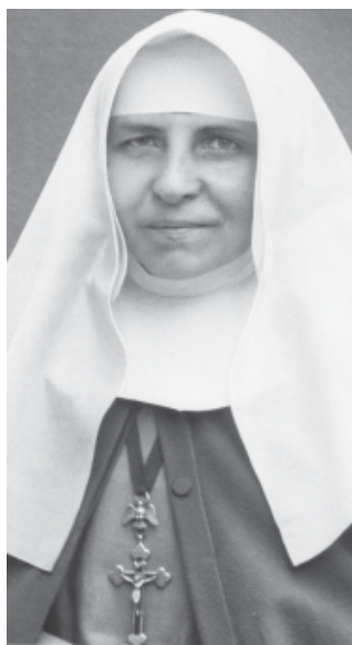
Bl. Josepha H. Stenmanns