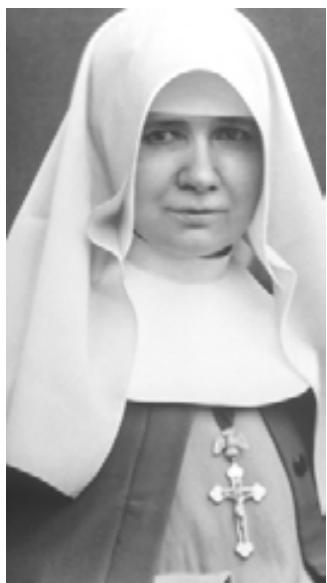
Bl. Maria Helena