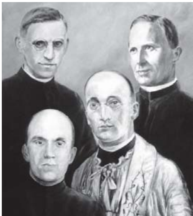
Bl. Louis Mzyk, Bl. Aloysius Liguda, Bl. Gregory Frackoowiak, Bl. Stanislaus Kubista