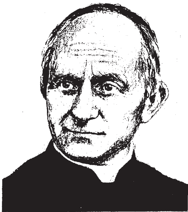
St. Arnold Janssen