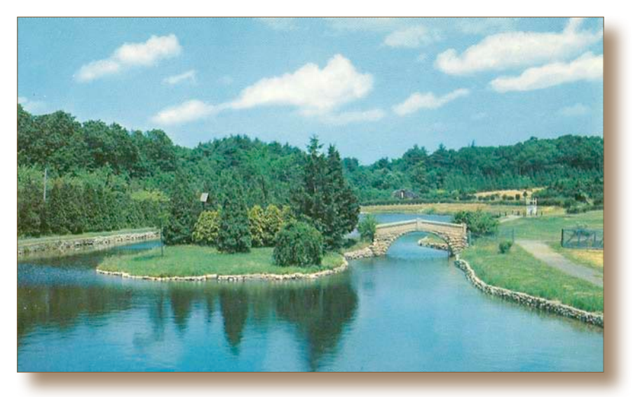
Miramar Pond, brick work by Brothers, dredging and filling is done by students; background, Lourdes' Grotto.

to old, antiquated methods, and do not keep abreast with modern times and methods.<sup>29</sup>