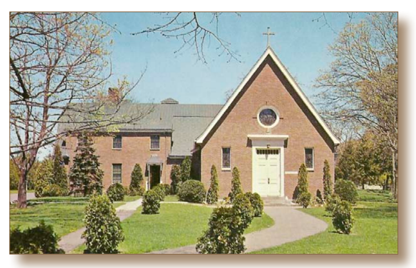
Miramar Chapel and Sisters Convent (built 1928).