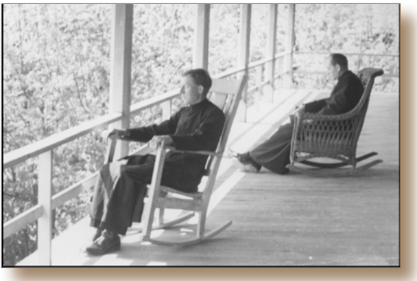
SVDs relaxing on the bishop's veranda.

Thirdly, there was no trained wine-maker available. The Diocese's own operations had been snarled on this thorn, a fact that ought to have raised a red flag and taught the Society a lesson.