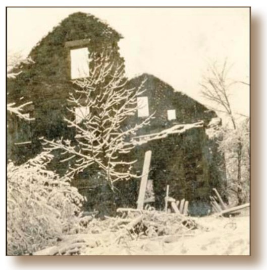
Ruins of the bishop's house.