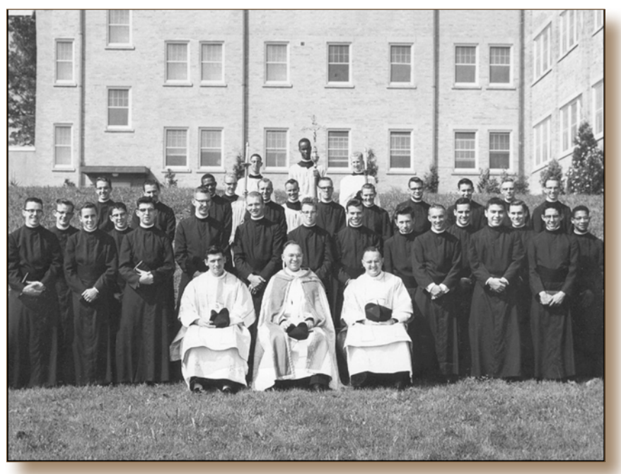
Good days at St. Michael's Mission remembered.