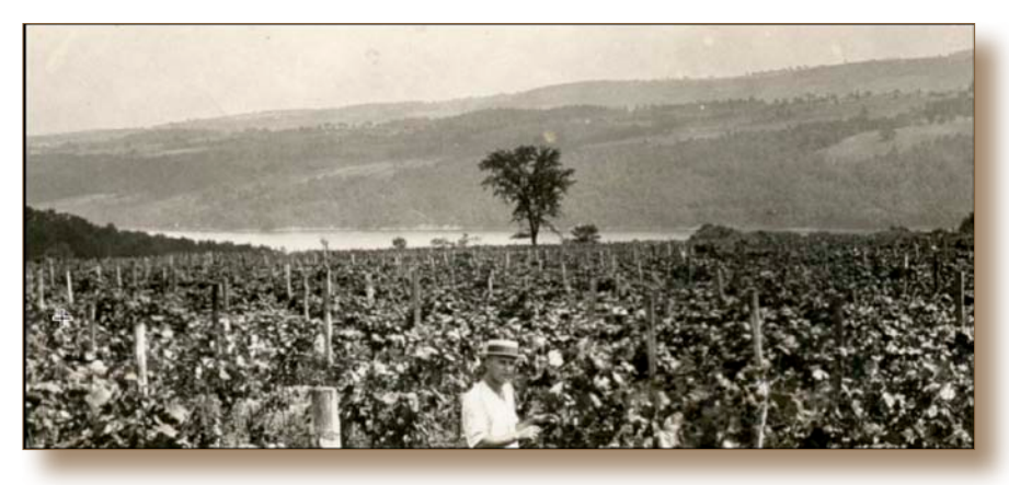
Vineyards on bishop's farm in the 1920s.

In 1929 the U.S. government gave permission to the Society to destroy what wine remained since most of it had already turned to vinegar and could not even be sold for enough money as vinegar to cover transportation costs. This helped the Society to avoid paying taxes on wine that was really vinegar.<sup>13</sup>