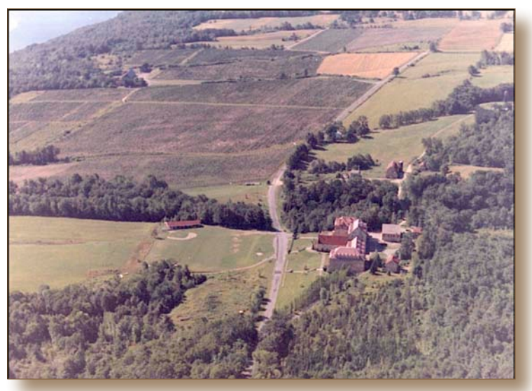
Aerial view of St. Michael Mission.

We are always beset with the secret little thought that maybe we shall sometime in the future be again looking for just such a place, so that we think the time has come for us to set up some form of ministry in the service of the Church. With some remodeling of the school building, and the refurbishing of the grottos and shrine, we think we can make a real contribution to the religious, educational and liturgical aims of the Holy Year with its mission theme of Evangelization.<sup>59</sup>