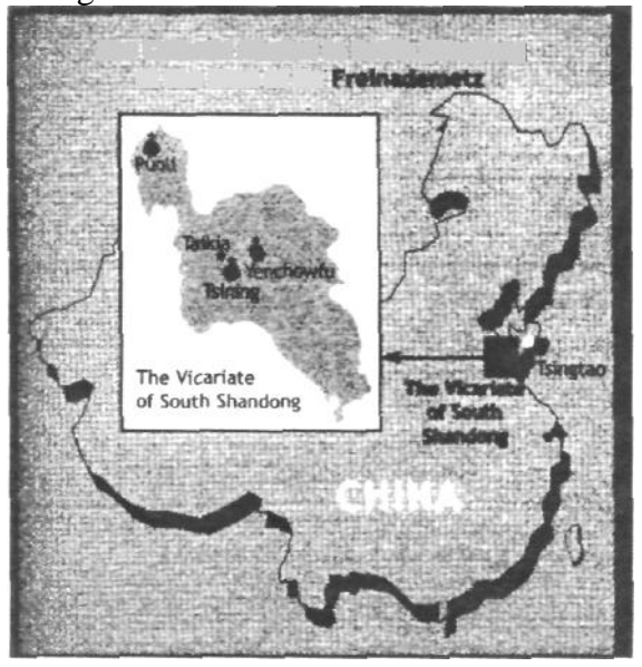
Shandong is another translation of the Chinese characters for Shantung.

drilling of recruits. Conditions grew more difficult for the missionaries and their Christians.