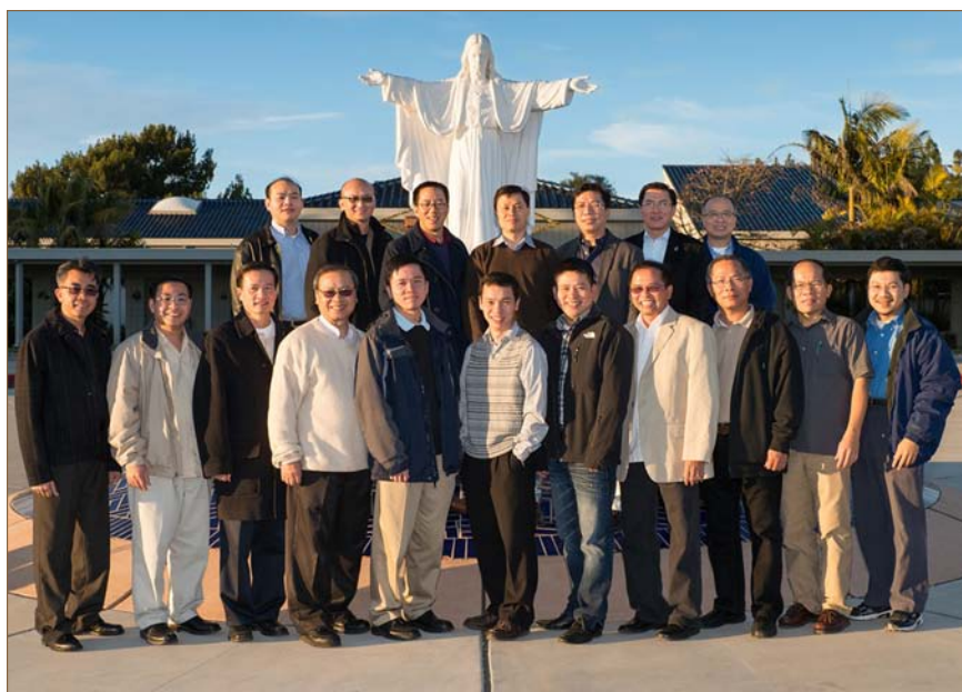
Vietnamese confreres gathered at Riverside, California, in 2012.