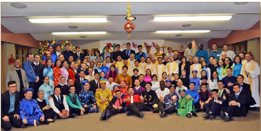
Divine Word College students and staff at 2015 Lunar New Year celebration.

Divine Word College and the Society of the Divine Word throughout the world have been so enriched over the years by the presence of the Vietnamese that it was decided several years ago to share this experience with other Vietnamese, especially with other religious. During the 2014-2015 academic year, 28 Vietnamese Sisters from several religious congregations were studying at Epworth – either in the English-as-Second-Language Program or for a college degree. In addition to a healthy touch of femininity, these young Sisters and their participation in every aspect of student life have brought a burst of renewed enthusiasm and life to the college. To add to the mix, during the last few years a handful of Vietnamese Cistercian monks also have come to Epworth to study at Divine Word College.