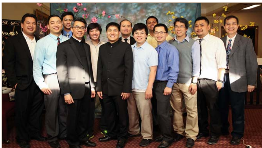
Divine Word Theologate students and staff at 2014 Lunar New Year celebration.