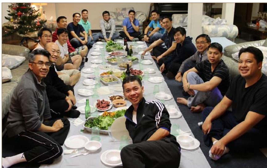
A 2014 Vietnamese Christmas gathering at Divine Word Theologate.

Today, the vibrant Society of the Divine Word province in Vietnam, dedicated to St. Joseph in memory of their origins, has more than doubled in size since the day the Brothers first asked to join the Society of the Divine Word. They now have 69 priests, nine Brothers in perpetual vows, five Brothers in temporary vows, 52 scholastics and 13 novices, for a total of 148 members.