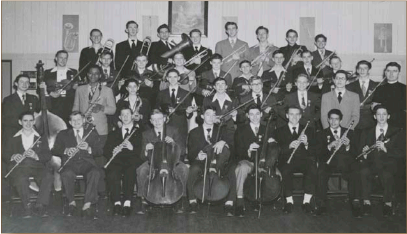
The seminary orchestra.