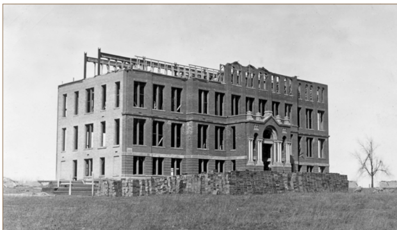
The seminary building under construction.