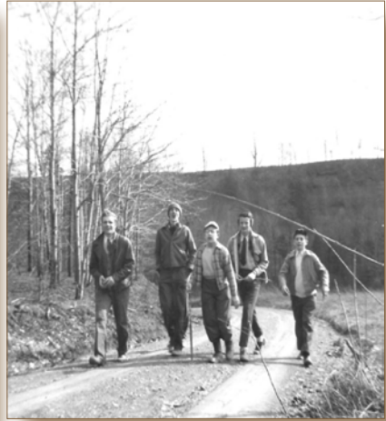
Hiking to Devil's Backbone.