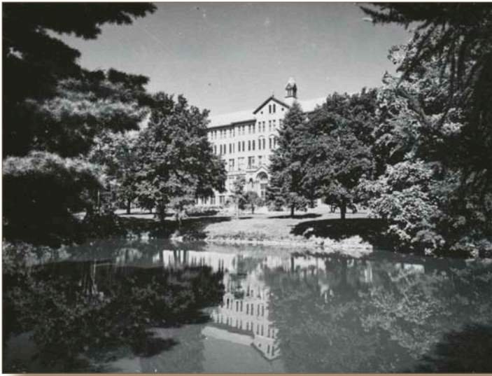
Sacred Heart Mission House.

secretary for showing up without prior notice. Then he learned that in the previous year (1911) the American Catholic Foreign Mission Society (Maryknoll) had been established, and that therefore “there is no place for such an institution (as the SVD) in the Archdiocese.” 3