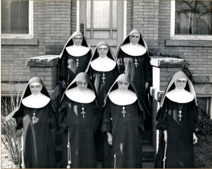
SSpS Sisters at their convent in Girard.

On October 4, 1912, the school began with seven seminarians.