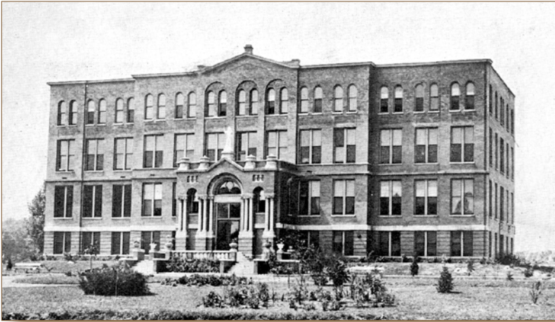
The original building completed, 1918.