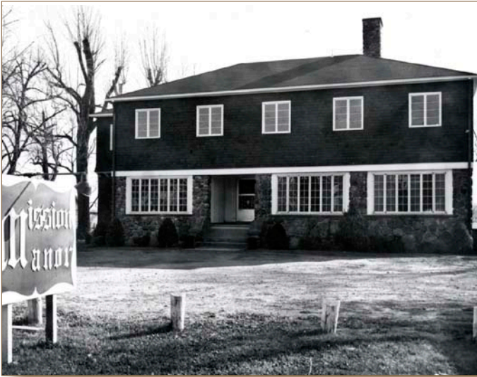
The Mission Manor.

complex was maintained by a small number of Brothers and priests. Meanwhile, the community 65 took up residence in the Mission Manor situated across the highway from the seminary site.