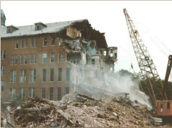
The demolition of the Sacred Heart Mission Seminary building.