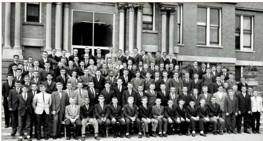
Sacred Heart Mission House student body.