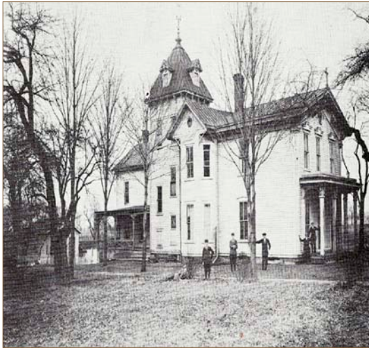
Original Culbertson home.