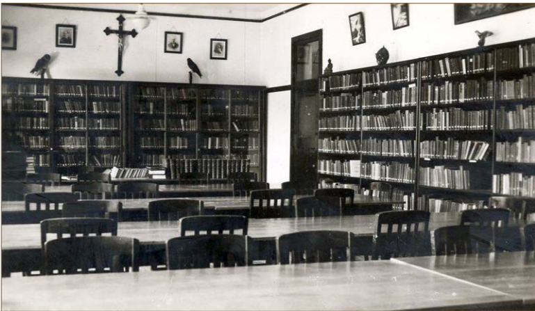
The seminary library.

The novices left East Troy on August 7, 1937, and with the arrival of the new high school students on September 7, a new era had begun.