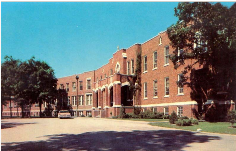
The main entrance of the new wing.

The beginnings of this marvelous development [the new buildings] go back to the disaster of March