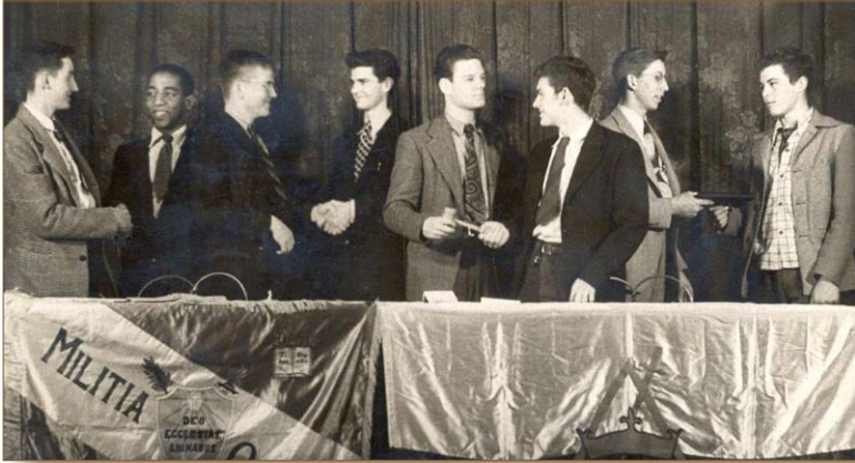
A Militia Orans (Mission Club) meeting.

the Sodality and thus one entertainment would be sufficient. Whatever possessed him I do not know but he met with so much opposition that the whole thing had to be put off for a few days. The boys are all up in the air about it.