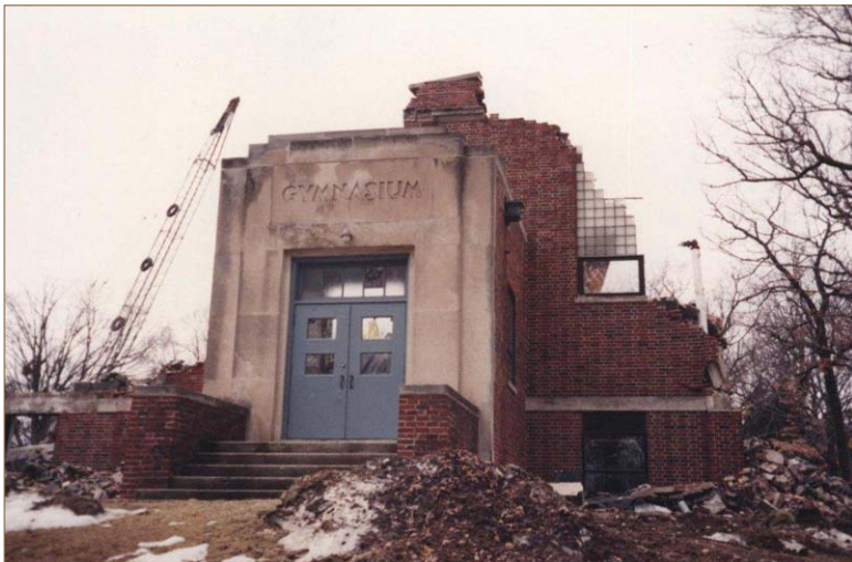
The end of the high school seminary era.

Plan B was based on the same assumptions but then involved removing some of the present buildings, but adding a new more functional structure. The Rector concluded in a cover letter: “Many members of our Province have asked me to urge you to go slowly in making any decision to demolish the school buildings, Chapel and Gymnasium.” 20