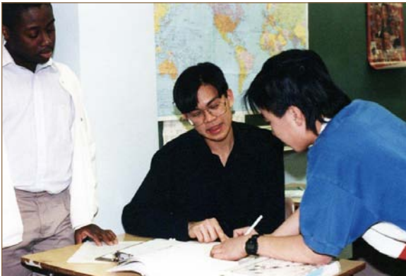
There was great diversity among students in the 1970s and '80s.