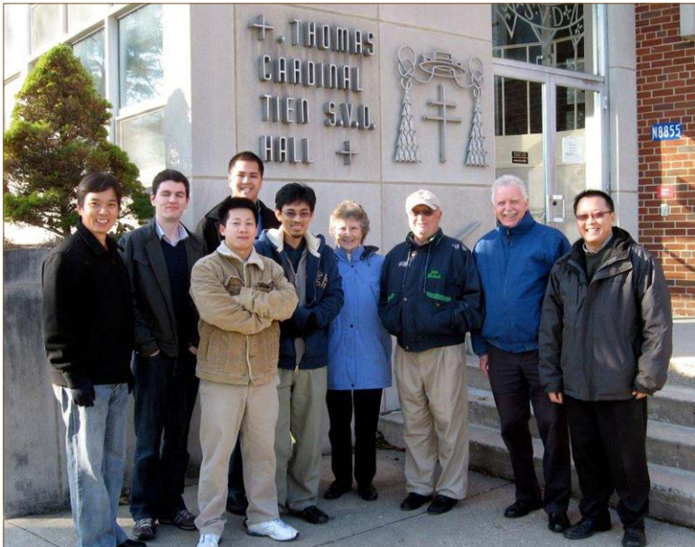
The pre-novitiate retreat, November 2009.

At present, East Troy serves as a Divine Word retirement community and as a place of hospitality, vacation, and retreat for SVD members and other religious. For example, formation groups from Divine Word College come to East Troy for their yearly retreats. The annual preparation program for those about to take perpetual vows as Divine Word Missionaries is conducted at East Troy, as is the yearly retreat for the pre-novitiate candidates and sometimes for novitiate retreats/desert days. This connection with the men in formation plus the opportunity to help foster and strengthen vocations is deeply appreciated by the East Troy community. The community has been and continues to be open to hosting local parish councils for days of recollection. Picnics