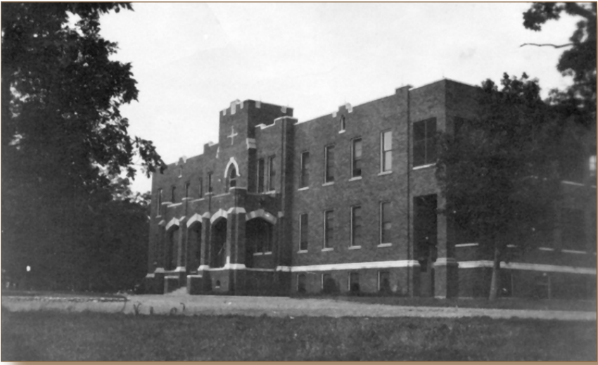
Novitiate and seminary, 1924-1993.

and making of our Novices a group of “breezy, goose-skinned, blue-nosed, red-eyed, tooth-chattering creatures.” (p. 124)