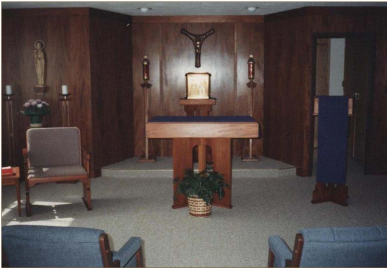
The current chapel.

It is a beautiful, healing, quiet, recollected spot, perhaps too easily taken for granted, if not forgotten, in our very fast world and hard-working committed life. In that beauty and quiet is the grace that reminds us that God is the Creator of all and that creation and beauty has a value in itself and in that points to the giftedness and uniqueness of every person apart from their function or usefulness.