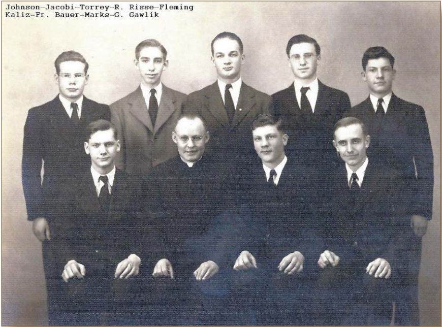
The 1945 graduation class.