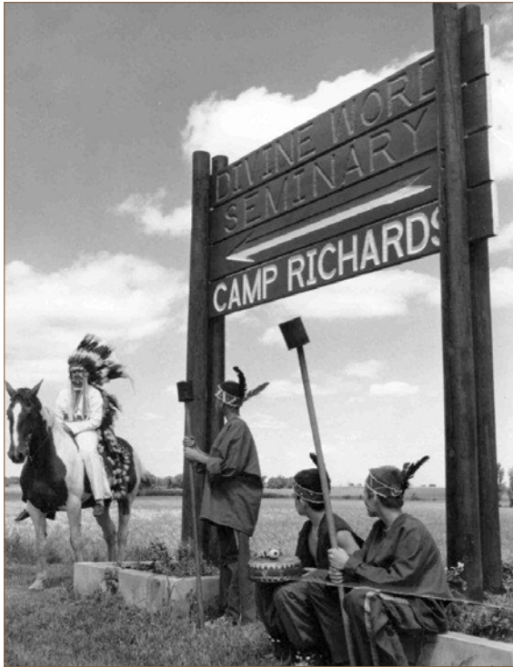
Camp Richards operated from 1949-1986.

with the seminarians. A camp in northern Michigan was offered to them and they might accept that. At the present he could not discuss any seminarians as counselors [for the proposed camp], since he was awaiting Father General's approval first.