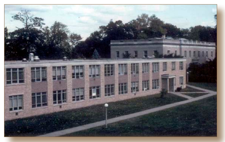
The completed school building with the mansion in the background.

gymnasium was not part of the original complex, but when it was built, it was the largest high school gym in Burlington County.