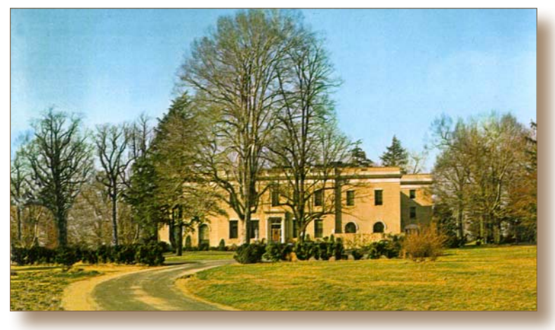
The Hammond mansion.