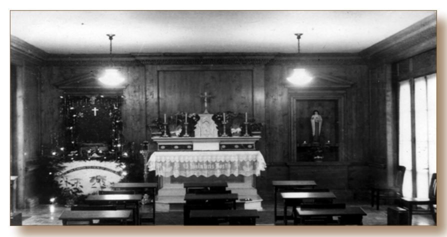
First Christmas at Bordentown, 1941.

December 9, 1941, we received the first $1 donation in the mail. Father Provincial had written an appeal letter to all former subscribers to C.F. [the Christian Family magazine] and Girard benefactors, asking them to correspond with us from now on. It was consoling to see something come in for a change, after looking at accumulating bills and other debts.<sup>13</sup>