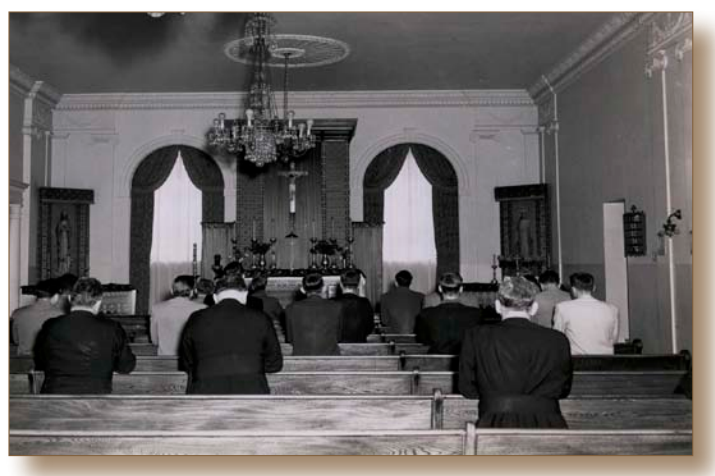
The mansion ballroom becomes a chapel.

Bordentown Seminary High School, to come and lend his talents to the students here.