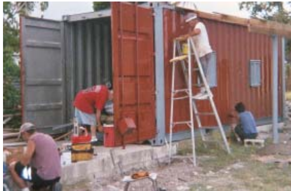
This "container" is used as the local food distribution center. Local residents come weekly for rice, flour, beans and other goods. Alumni painted the container and added a roof over the "windows."