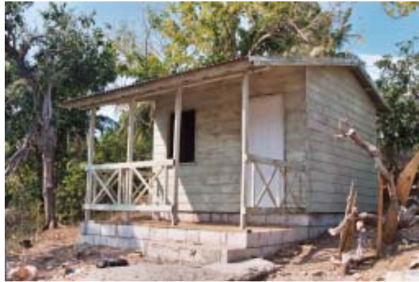
Alumni and crew completed this house in just five days! It is the new home to a single man who belongs to Our Lady of the Assumption Parish.