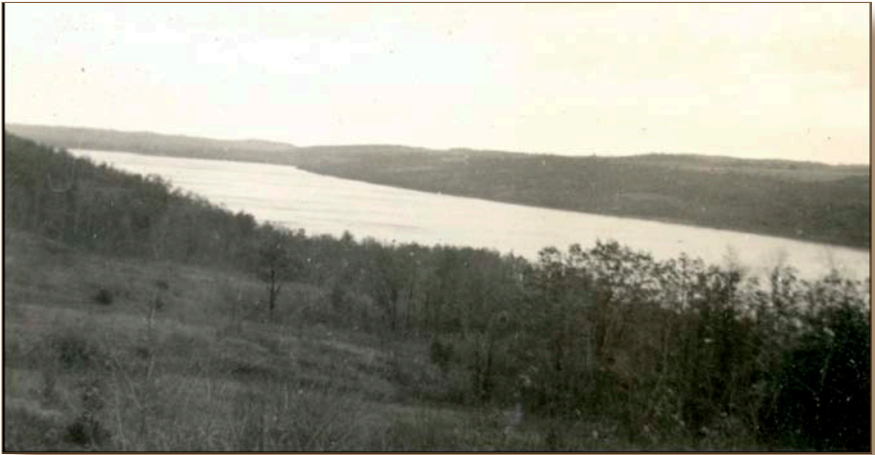
A view of Hemlock Lake from the vineyard.