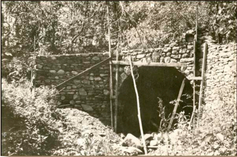
Repairs being made on the grottoes.

for alcoholics at Conesus and received approval, according to local newspapers. 68