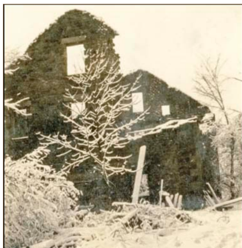
Ruins of the bishop's house.