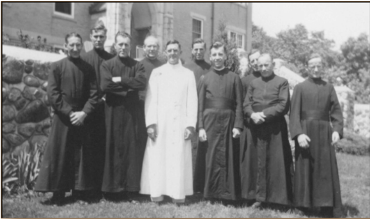
Some of the Brothers of Conesus.