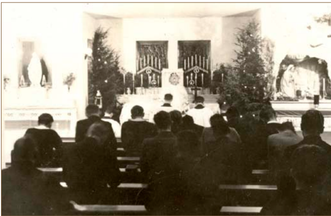
Conesus Chapel at Christmas in the late 1930s.