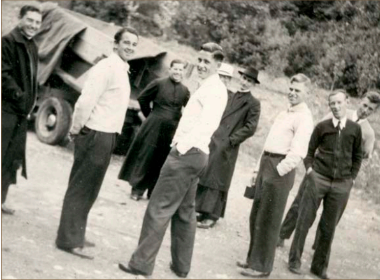
Belated vocations with faculty in 1939.