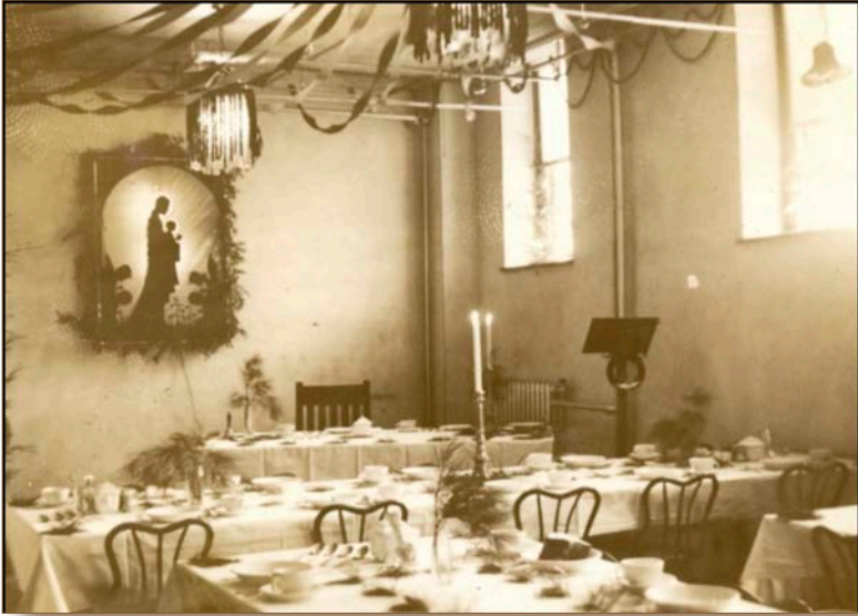
The community dining room.