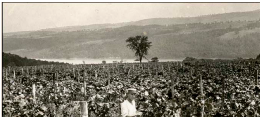
Vineyards on bishop's farm in the 1920s.

In 1929 the U.S. government gave permission to the Society to destroy what wine remained since most of it had already turned to vinegar and could not even be sold for enough money as vinegar to cover transportation costs. This helped the Society to avoid paying taxes on wine that was really vinegar. 13