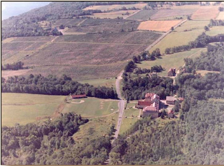
Aerial view of St. Michael Mission.

We are always beset with the secret little thought that maybe we shall sometime in the future be again looking for just such a place, so that we think the time has come for us to set up some form of ministry in the service of the Church. With some remodeling of the school building, and the refurbishing of the grottos and shrine, we think we can make a real contribution to the religious, educational and liturgical aims of the Holy Year with its mission theme of Evangelization. 59