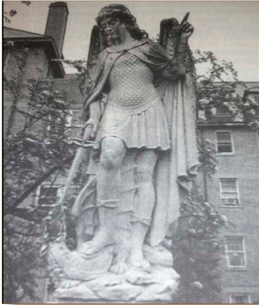
The Statue of St. Michael the Archangel.