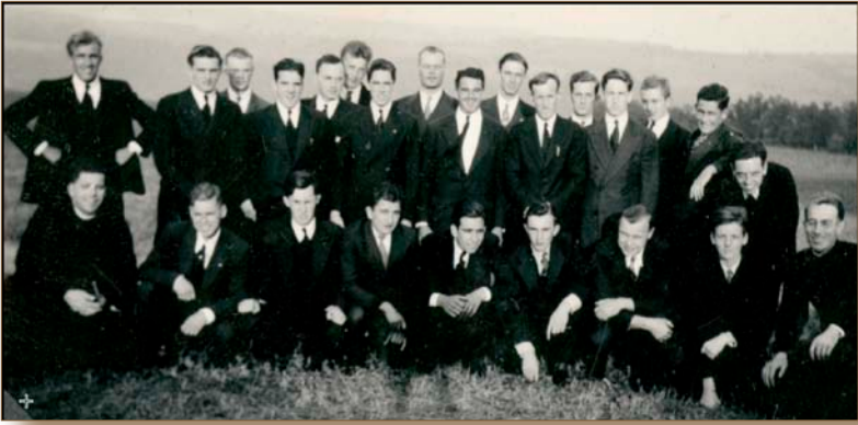
Seminarians and prefects ca. 1940.