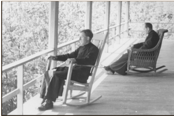
SVDs relaxing on the bishop's veranda.

Thirdly, there was no trained wine-maker available. The Diocese's own operations had been snarled on this thorn, a fact that ought to have raised a red flag and taught the Society a lesson.