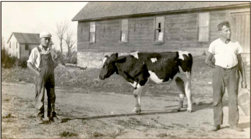
Workers on the bishop's farm.