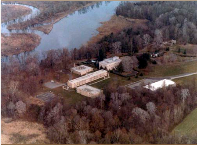
Aerial view of Divine Word Seminary in the 1970s.