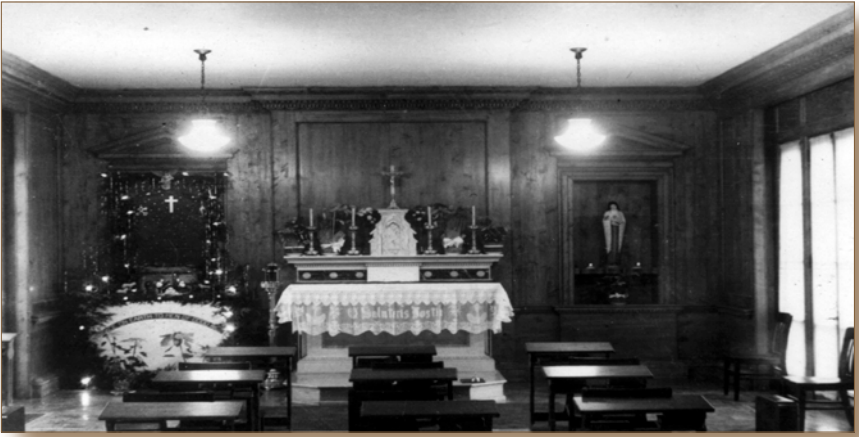
First Christmas at Bordentown, 1941.

December 9, 1941, we received the first $1 donation in the mail. Father Provincial had written an appeal letter to all former subscribers to C.F. [the Christian Family magazine] and Girard benefactors, asking them to correspond with us from now on. It was consoling to see something come in for a change, after looking at accumulating bills and other debts. 13