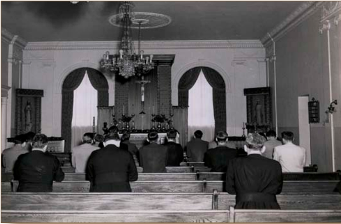
The mansion ballroom becomes a chapel.

Bordentown Seminary High School, to come and lend his talents to the students here.