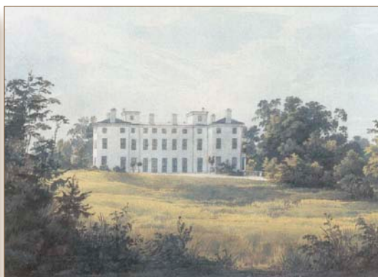
The second Bonaparte mansion.