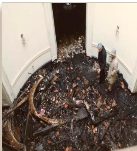
The mansion rotunda before and after the fire.