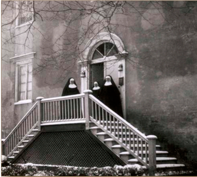
Franciscan Sisters at gate house / convent.