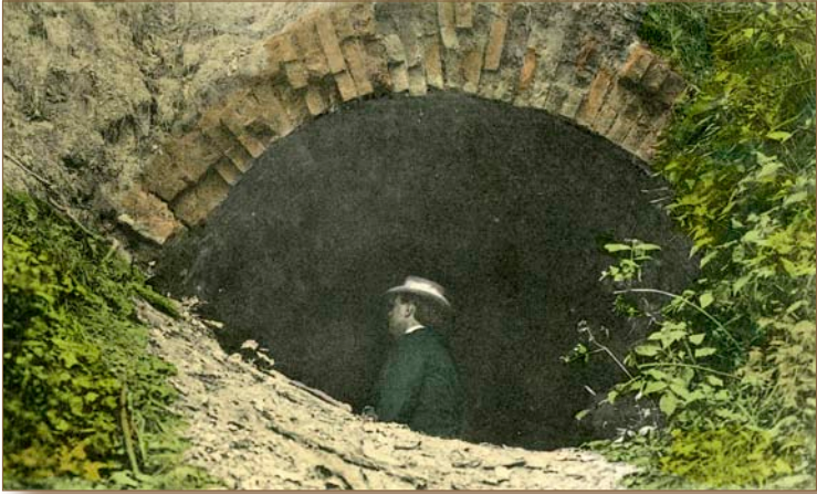
Tunnel entrance from Crosswicks Creek.

On August 18, 1942, another important guest who graced the new St. Joseph's Mission House was Dorothy Day, founder of the Catholic Worker . 25