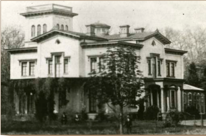
The Beckett mansion.

He hired stonemasons to build a large Chinese water garden that was to have had small boats floating in the water. The majority of the floors were built with inlaid wood or marble. The dining room, private study, and parlor were paneled with pine that had come from a castle in England. Mr. Hammond also built a secret wine cellar that was accessible from his private study through a hidden metal stairwell that led to the basement. In the wine cellar, he had many bottles of wine and liquor that evidently were purchased during Prohibition.