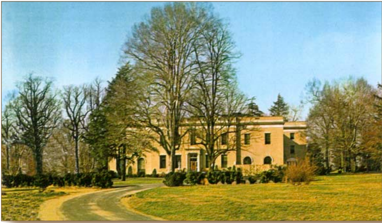
The Hammond mansion.