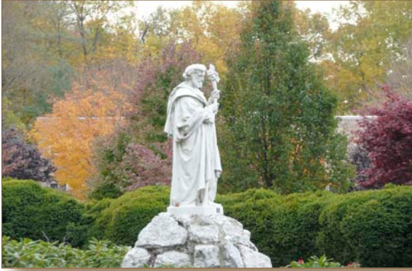
St. Joseph standing watch over the property.