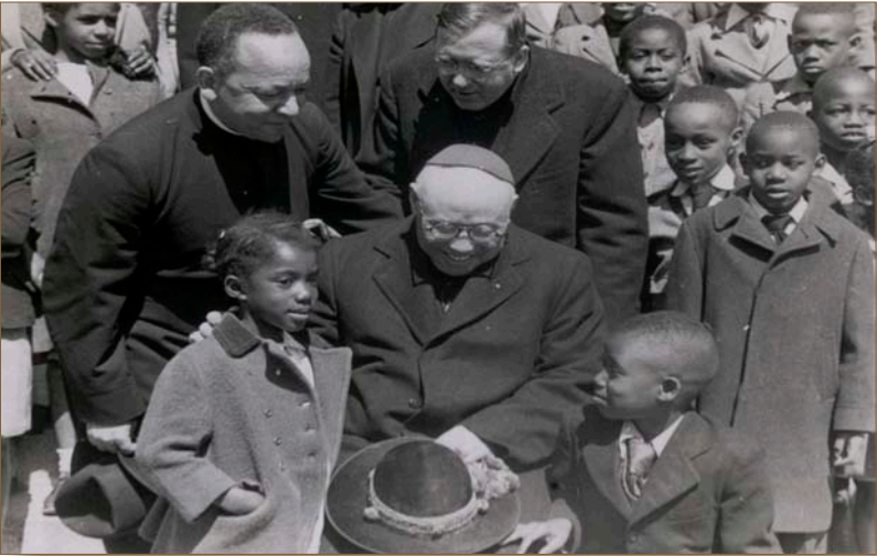
Thomas Cardinal Tien with children from Our Lady of the Divine Shepherd, Trenton, New Jersey.

I am very happy to tell you what is happening at St. Joseph's Mission House, Bordentown, New Jersey. A few years ago, the Society of the Divine Word bought the historic Bonaparte estate in Bordentown.