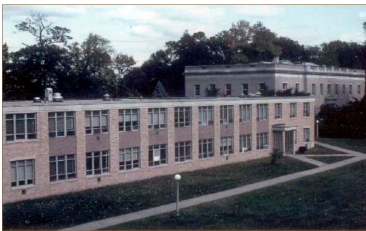
The completed school building with the mansion in the background.

gymnasium was not part of the original complex, but when it was built, it was the largest high school gym in Burlington County.